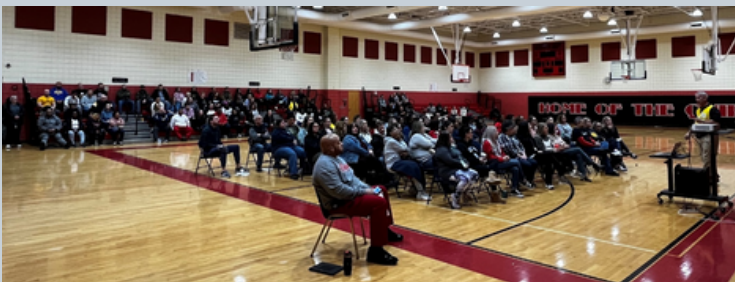
Aliquippa Elementary , January 13, 2023

Beaver County Emergency Services facilitated Active Shooter Training and Exercises at multiple locations during the first two quarters of 2023. Each event was supported by the School District and local law enforcement agencies of jurisdiction. Additionally, the Beaver County District Attorney's and Sheriff's Offices and Medic Rescue partnered with Emergency Services to deliver the trainings.