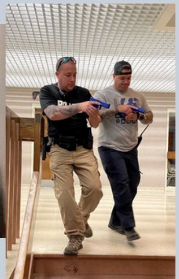
Beaver County Career Technologies Center, June 2, 2023