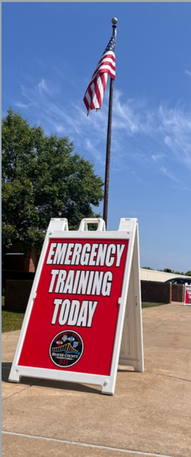
Emergency Services' Mobile Communications Unit was utilized at active shooter training events to enhance the exercises by receiving additional calls and creating more realistic practice scenarios. It also enabled 911 staff to train on Mobile Comm's systems.