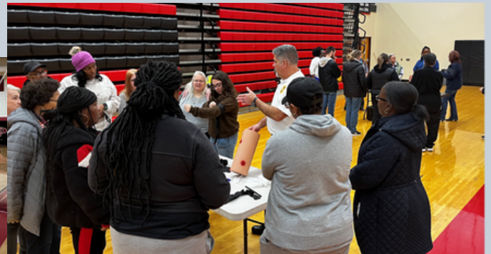
Beaver Falls Area School District, January 30, 2023